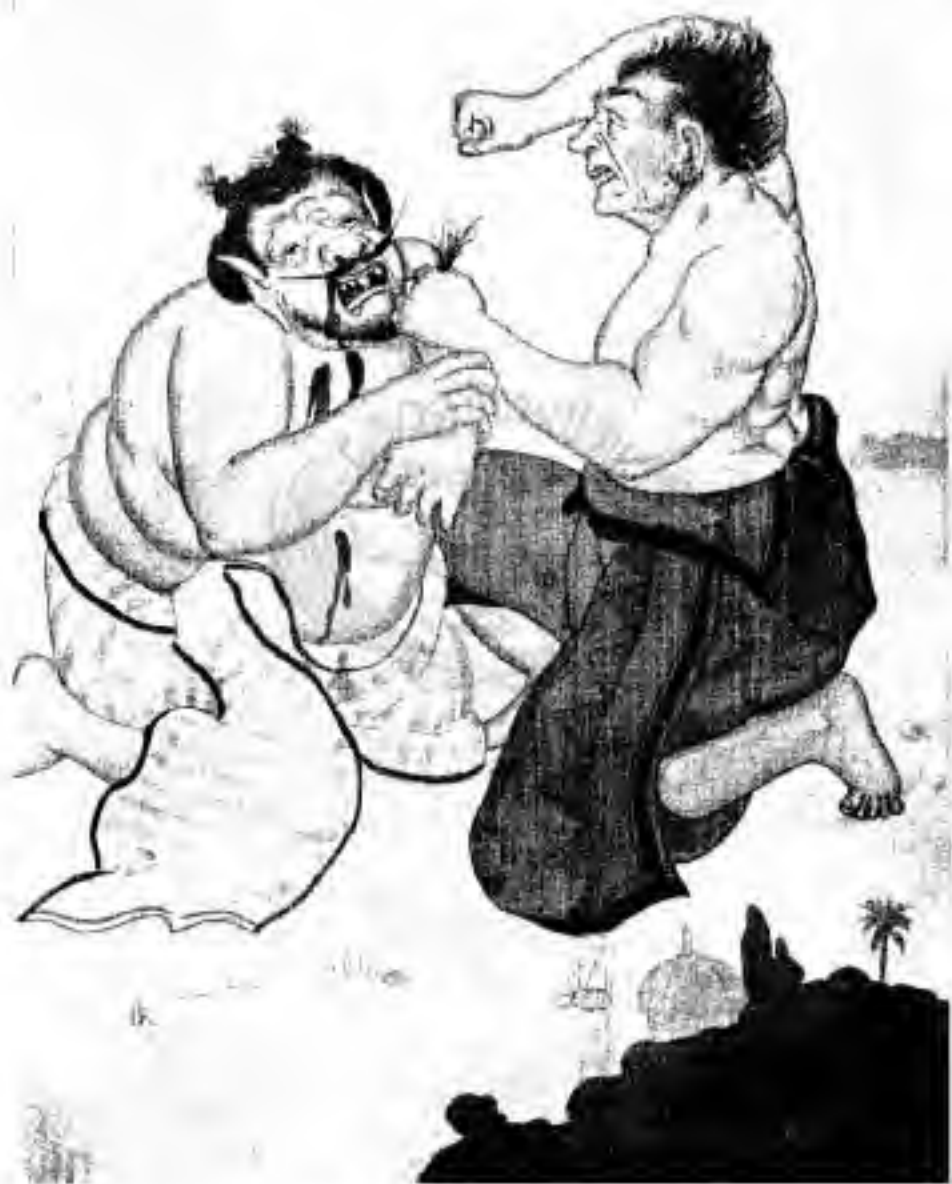
"Both then began to fight."